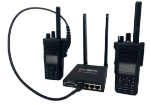
3 Traditional PTT Gateway and Radios